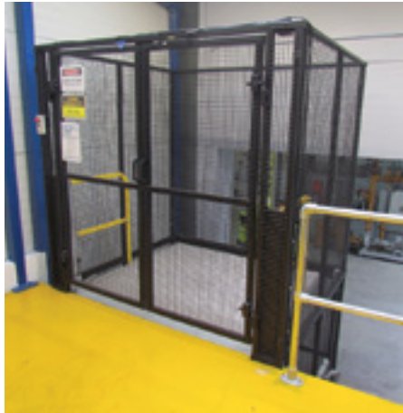
Loading bay level

A cost effective BayLift suitable for exterior sites and for loading applications where the change in level is less than 2500mm. Fully guarded for extra safety and security.