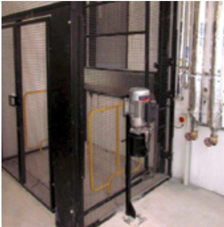
Fully Guarded design