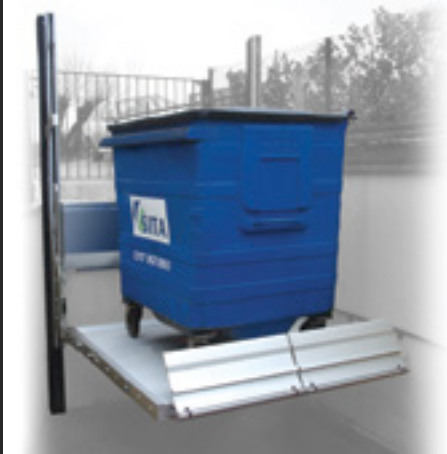
Loading Bay design