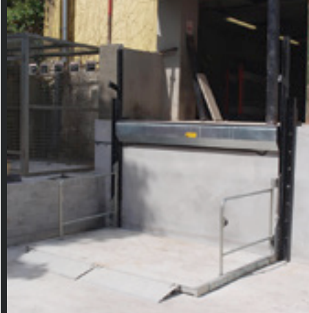
Vertical BayLift with platform lowered

The BayLift is ideal for lifting loads between different levels where the height difference is less than 1500mm, such as loading bays and docks.